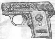
ASTRA Pistol, Mod. 202 With fine engravings in silverplated finish.